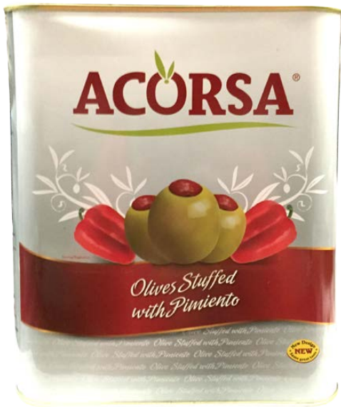
Green Queen Stuffed Olives (91/110) 8kg x 2 - ACO09C