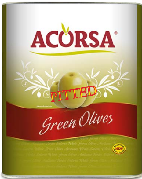
Green Queen Olives Pitted (90/100) 8kg x 2 - ACO09D