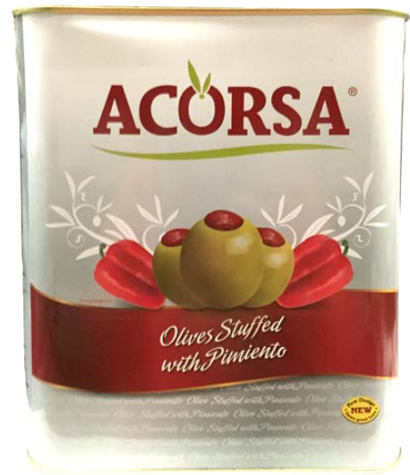
Green Stuffed Olives (241/260) 8kg x 2 - ACO09A