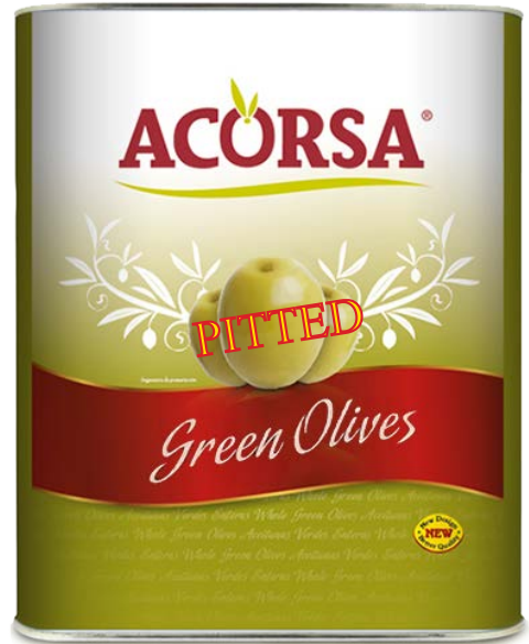
Green Pitted Olives (241/260) 8kg x 2 - ACO09