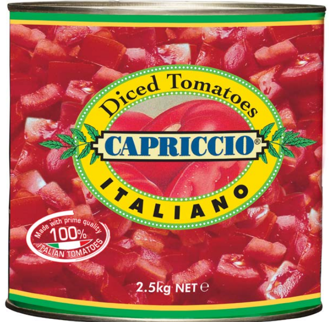
Diced Tomatoes 2.5kg x 3 - CAPR009BX3