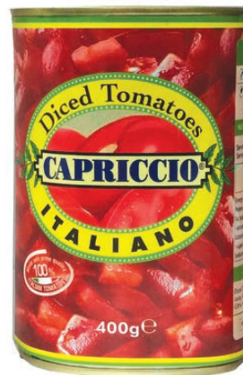
Diced Tomatoes 400g x 12 - CAPR009AX12