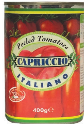
Peeled Tomatoes 400g x 12 - CAPR005X12