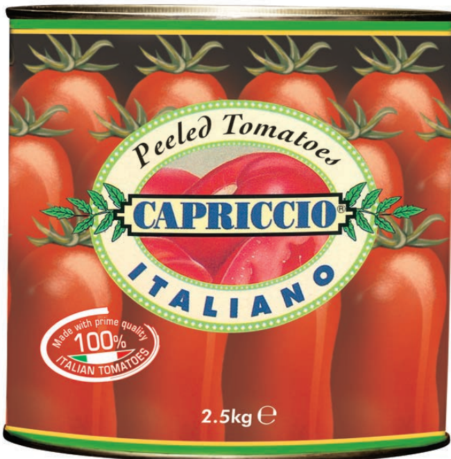
Peeled Tomatoes 2.5kg x 3 - CAPR004X3