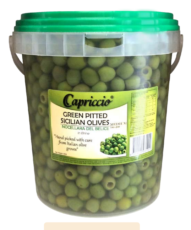
Pitted Sicilian Olives Nocellara 4kg x 2 - CAPR039