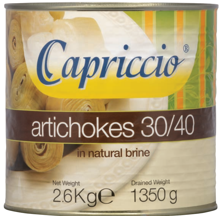
Artichoke Hearts 30/40 2.6kg x 6 - CAPVEG11