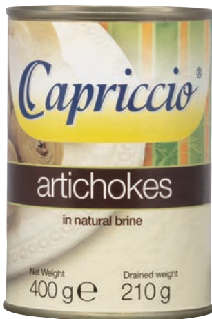
Artichoke Hearts 5/6 400g x 12 - CAPVEG11A