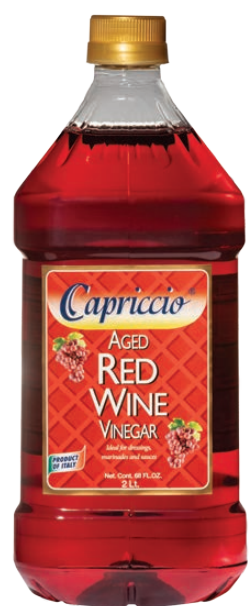
Aged Red Wine Vinegar 2lt x 3 - CAPVIN11