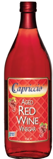
Aged Red Wine Vinegar 1lt x 6 - CAPVINRX6