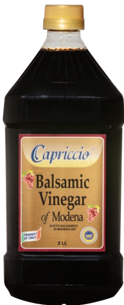
Balsamic Vinegar 2lt x 3 - CAPVIN10