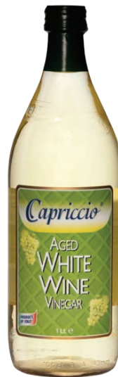
Aged White Wine Vinegar 1lt x 6 - CAPVINWX6