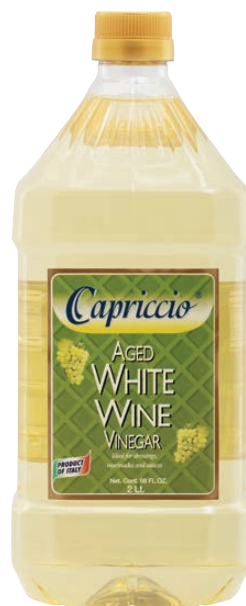
Aged White Wine Vinegar 2lt x 3 - CAPVIN12