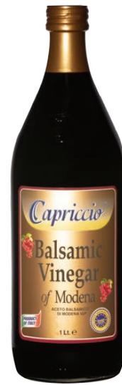
Balsamic Vinegar 1lt x 6 - CAPVINBALX6