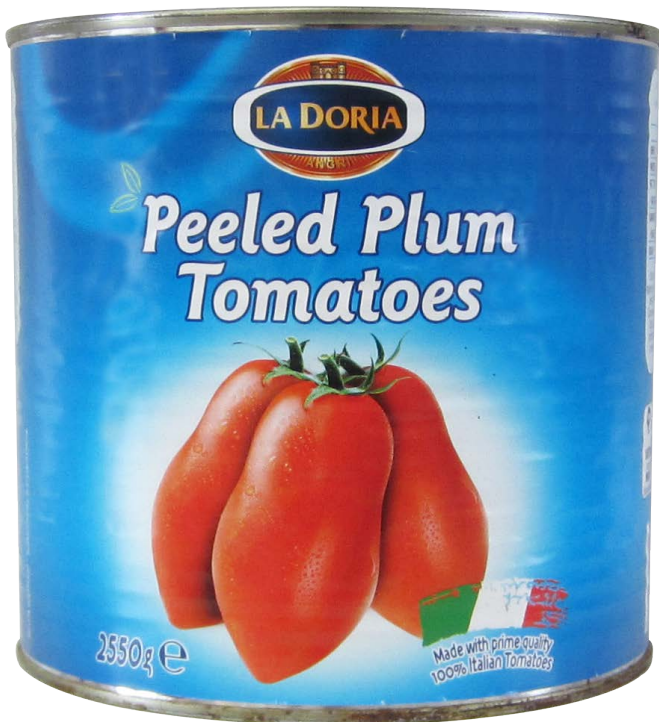
Peeled Plum Tomatoes 2.55kg x 3 - LAD02X3