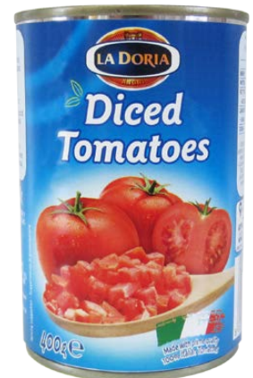
Diced Tomatoes 400g x 12 - LAD03X12