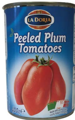
Peeled Plum Tomatoes 400g x 12 - LAD01X12