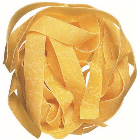
Pappardelle 250g x 12 - P205X12