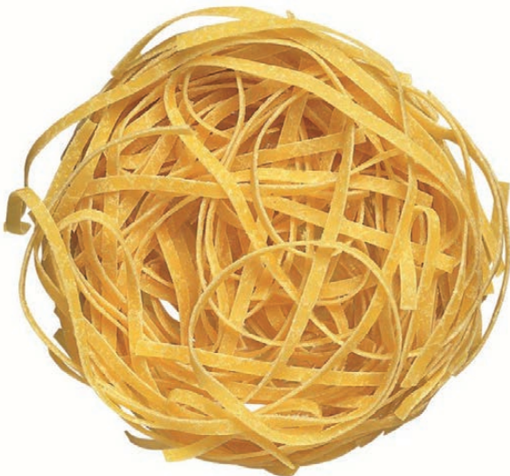
Taglierini 250g x 12 - P202X12