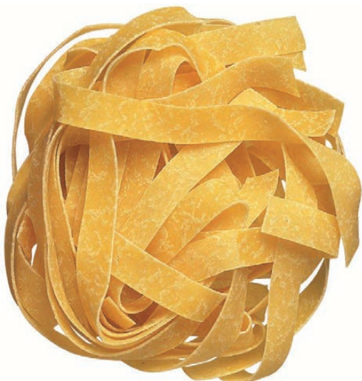
Fettuccine 250g x 12 - P204X12