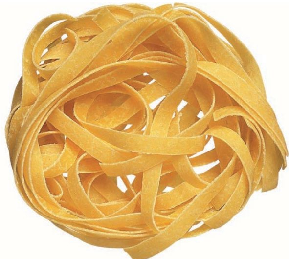
Tagliatelle 250g x 12 - P203X12