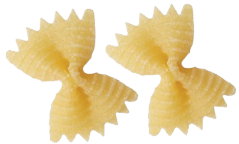
Farfalle Rigate 500g x 24 - P66