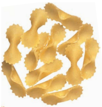
Tripoline 500g x 24 - P68x24