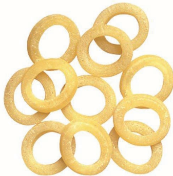
Anelli Siciliani 500g x 24 - P60A