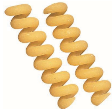
Fusilli Corti Bucati 500g x 24 - P108