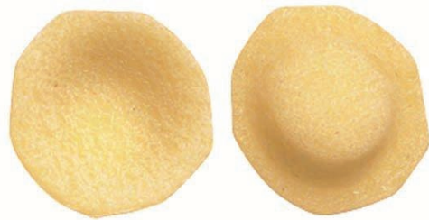
Orecchiette Pugliese 500g x 24 - P30