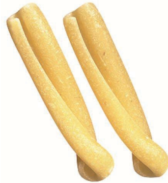
Caserecce Molisane 500g x 24 - P29