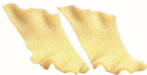
Pantacce Toscane 500g x 20 - P106