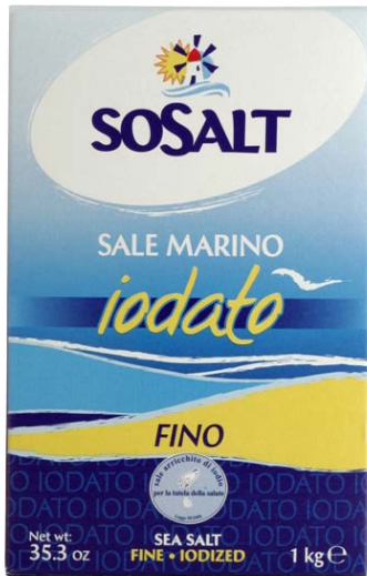
Sea Salt Fine - Iodized 1kg x 12 - SOSALT06