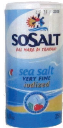
Sea Salt Very Fine - Iodized 250g x 15 - SOSALT04A