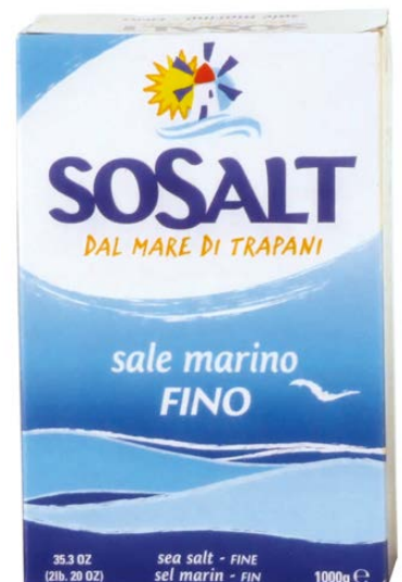
Sea Salt Fine 1kg x 12 - SOSALT02