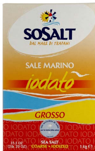
Sea Salt Coarse - Iodized 1kg x 12 - SOSALT05