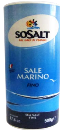
Sea Salt Fine 500g x 12 - SOSALT03A