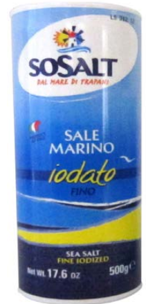
Sea Salt Fine - Iodized 500g x 12 - SOSALT03B