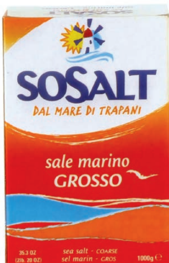
Sea Salt Coarse 1kg x 12 - SOSALT01