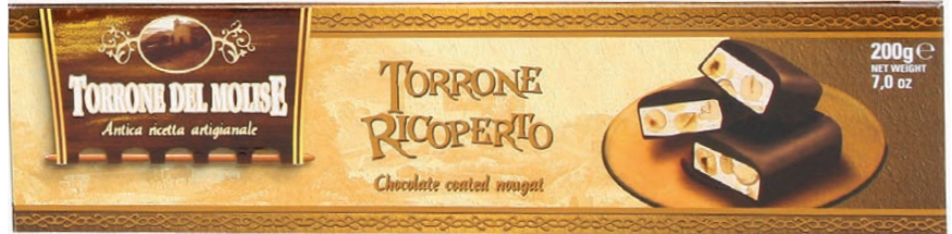
Ricoperto (Hard Nougat with Hazelnuts coated in Chocolate) 200g x 12 - TOR06