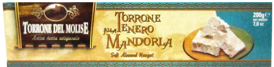
Torrone Tenero alla Mandorla (Soft Nougat with Almonds) 200g x 12 - TOR21