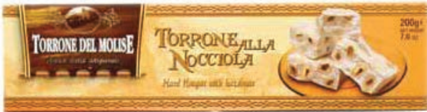
Torrone Alla Nocciola (Hard Nougat with Hazelnuts) 200g x 12 - TOR10