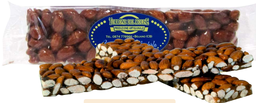
Croccante alle Mandorle (Almond Brittle) 150g x 24 - TOR23