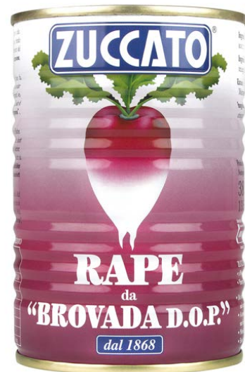
Brovada 385g x 12 - ZUC25