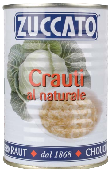
Sauerkraut in Natural Brine 385g x 12 - ZUC01