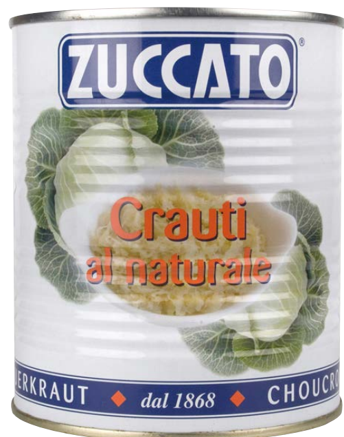
Sauerkraut in Natural Brine 770g x 12 - ZUC01AA