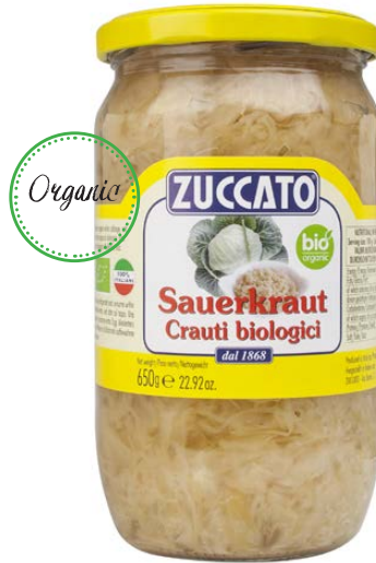
Sauerkraut Natural Bio Organic 350g x 6 - ZUC01D