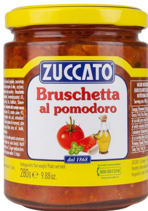
Bruschetta al Pomodoro (Tomatoes) 280g x 6 - ZUC68