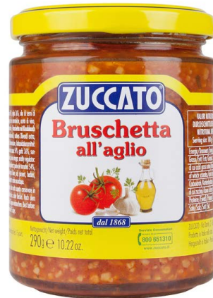
Bruschetta Aglio (Garlic) 290g x 6 - ZUC66