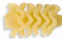
Radiatori 500g x 24 - P73