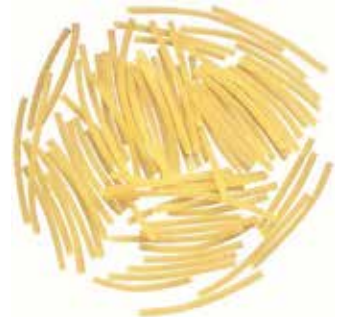
Capellini Spezzati 500g x 24 - P60