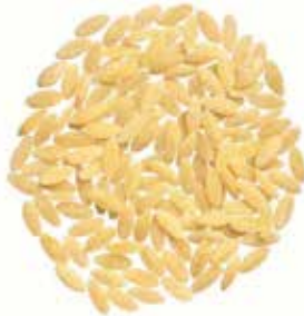
Pasta A Riso 500g x 24 - P62