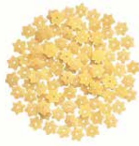
Stelline 500g x 24 - P59