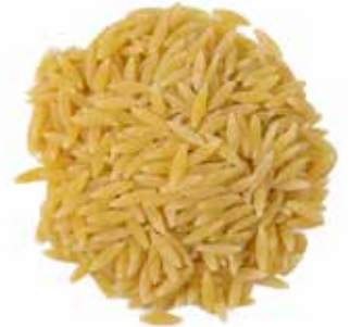
Orzo 500g x 24 - P65