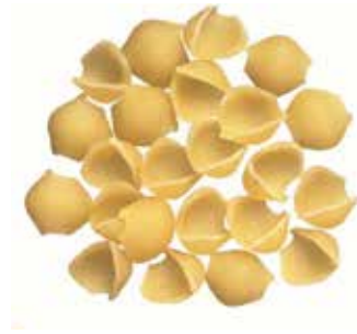
Cinesine 500g x 24 - P57