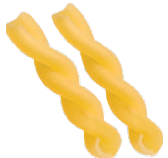
Gemelli 500g x 24 - P80