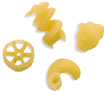
Insalata di Pasta 500g x 24 - P72