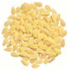
Semi Di Melone 500g x 24 - P61