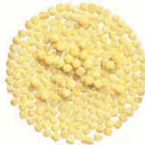
Peperini 500g x 24 - P64