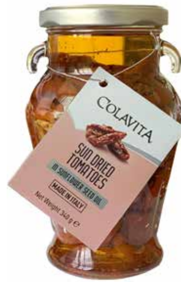
Sun Dried Tomatoes 340g x 6 - COLSUN07/A