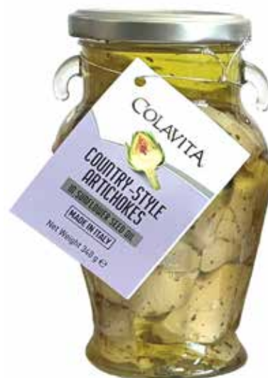
Country Style Artichokes 340g x 6 - COLSUN05/A