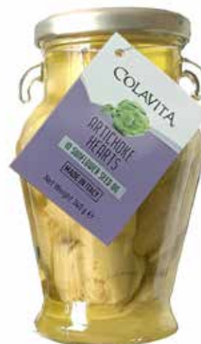
Artichoke Hearts 340g x 6 - COLSUN01/A