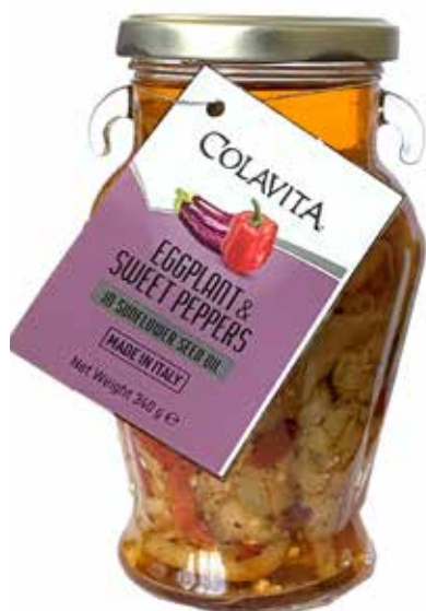
Eggplants and Peppers 340g x 6 - COLSUN13/A