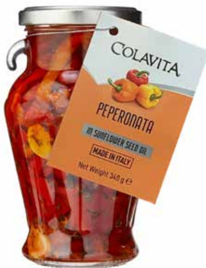
Peperonata 340g x 6 - COLSUN09/A