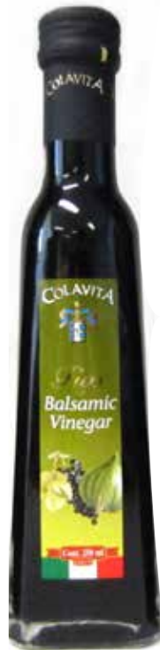
Fig Balsamic Vinegar 250ml x 6 - COLV9B