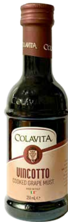
Vinocotto Cooked Grape Must 250ml x 6 - COLV9C