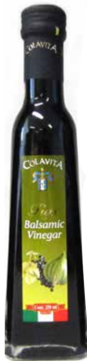
Fig Balsamic Vinegar 250ml x 6 - COLV9B