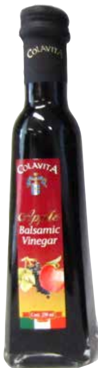
Apple Balsamic 250ml x 6 - COLV9A