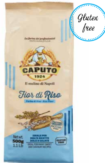
Fior Di Riso 500g x 12 - CAP12A