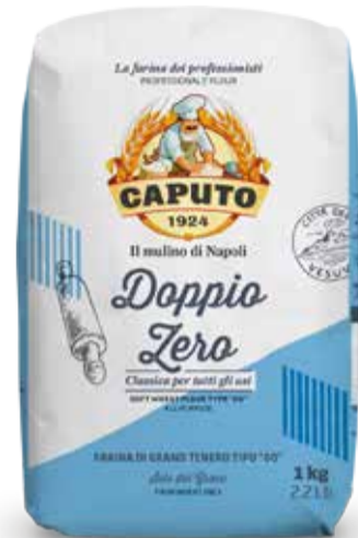
Flour 00 Classica - Light Blue 1kg x 10 - CAP11