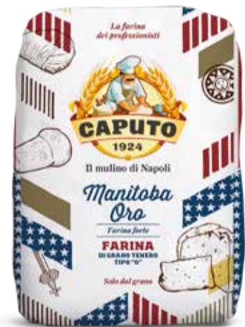
Flour 0 Manitoba Oro 1kg x 10 - CAP16