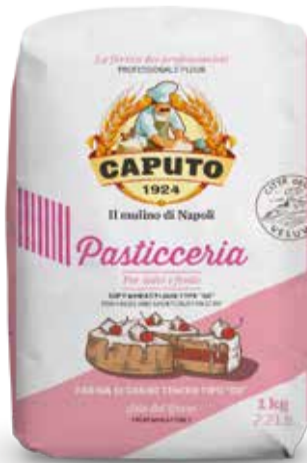
Flour 00 Pasticceria 1kg x 10 - CAP17A