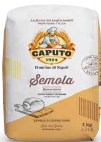
Flour Semola Di Grano Duro Rimacinata - Pasta & Breads 1kg x 10 - CAP07