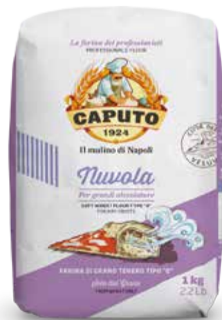
Flour 0 Nuvola 1kg x 10 - CAP17B