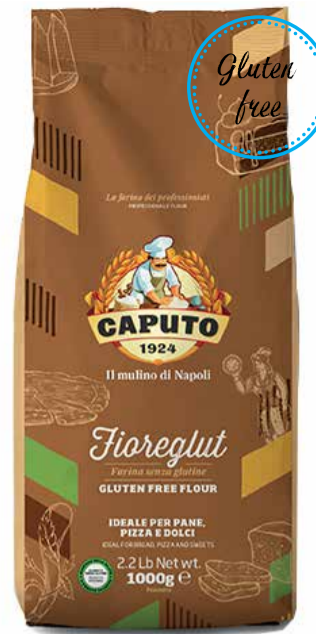
Flour Fiore Glut (Gluten Free) 1kg x 12 - CAP13