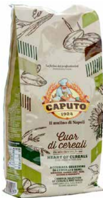
Cuor di Cereali 1kg x 10 - CAP17