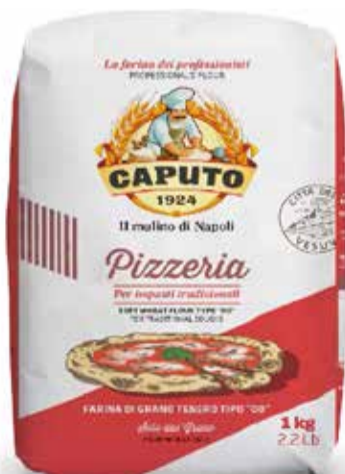
Flour 00 Pizzeria - Red 1kg x 10 - CAP28