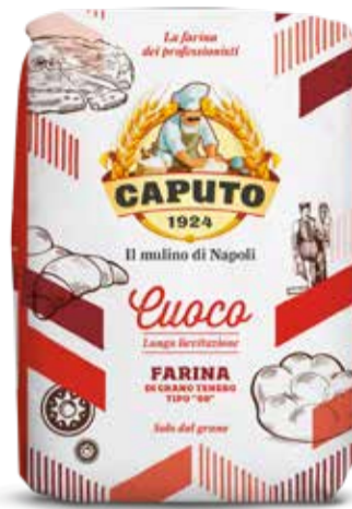
Flour 00 Cuoco - Chef - Red 1kg x 10 - CAP10