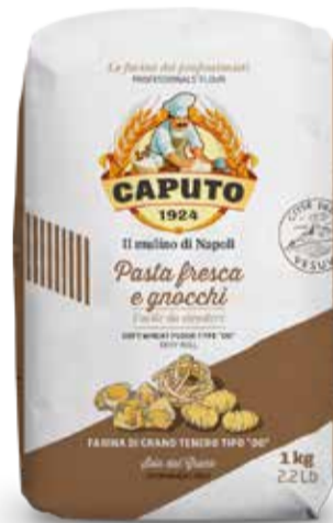
Flour 00 Pasta Fresca & Gnocchi 1kg x 10 - CAP15