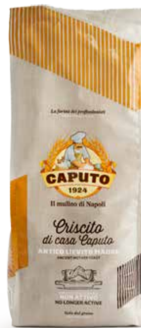
Criscito Naturale - Natural Yeast 1kg x 10 - CAP14