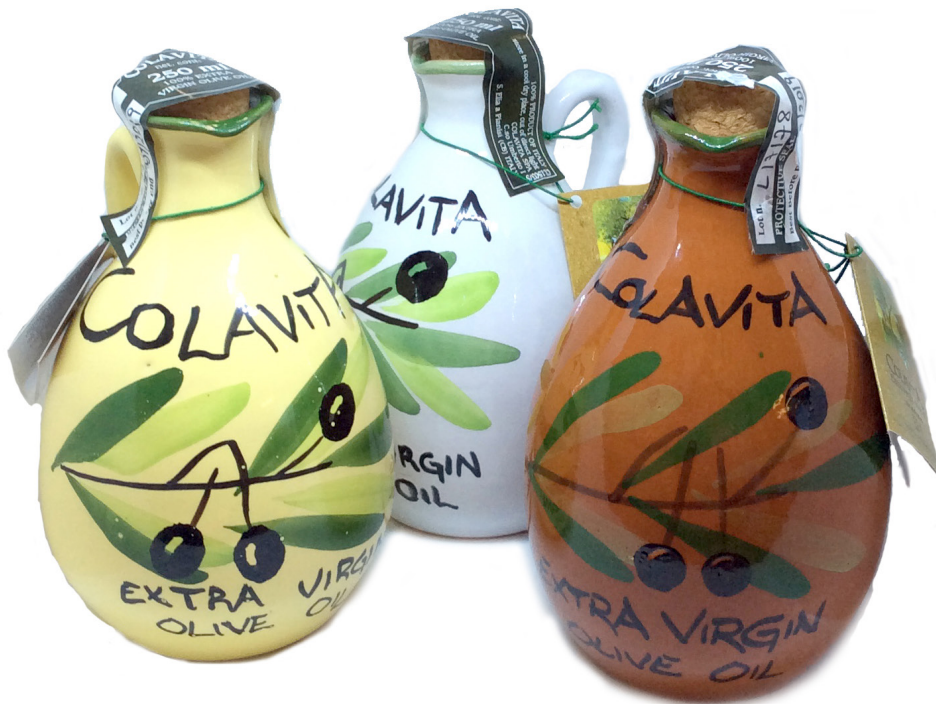
Extra Virgin Olive Oil Ceramica - Tris 250ml x 6 - CECERA1