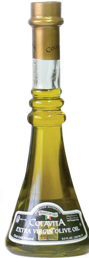
Extra Virgin Olive Oil Cold Production - Tusca 250ml x 6 - CE250TUSCA