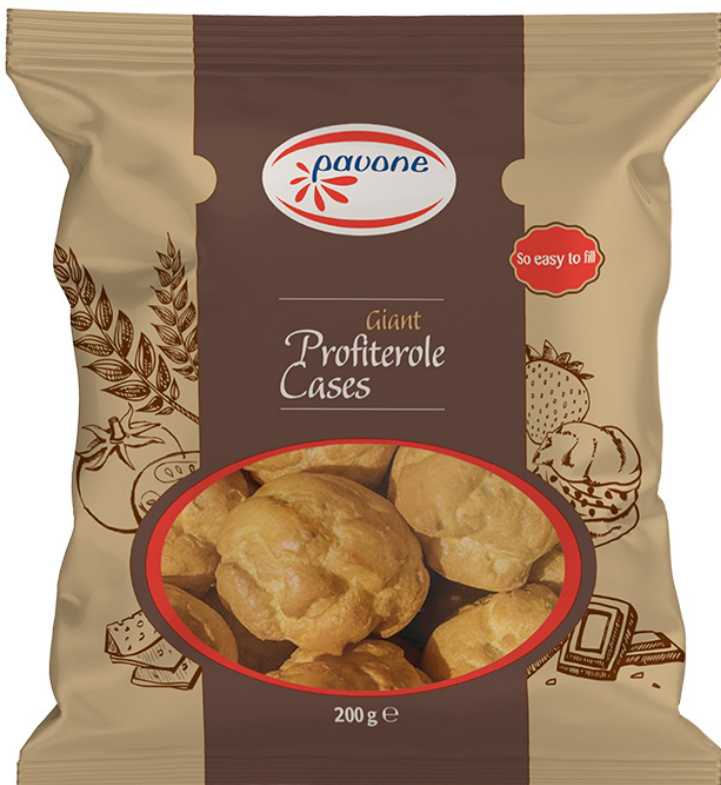
Bigne Large Profiteroles 200g x 8 - PV200