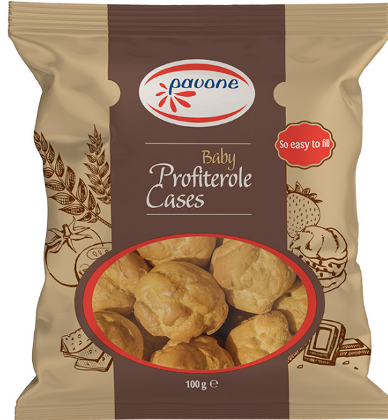
Bigne Small Profiteroles 100g x 12 - PV100