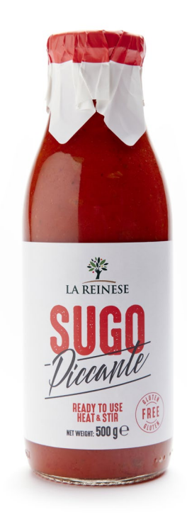
Tomato Sauce with Hot Pepper 500g x 6 - LARE05