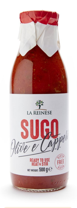
Tomato Sauce with Olives and Capers 500g x 6 - LARE06