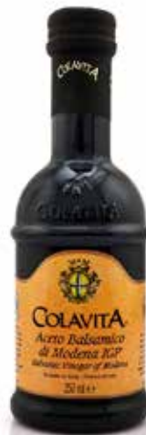
Sweet Balsamic Vinegar Timeless 250ml x 6 - COLV9D