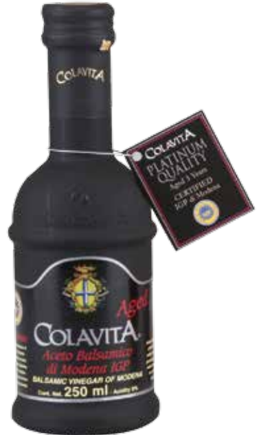
3 Y.O. Aged Balsamic Vinegar 250ml x 6 - COLV9F