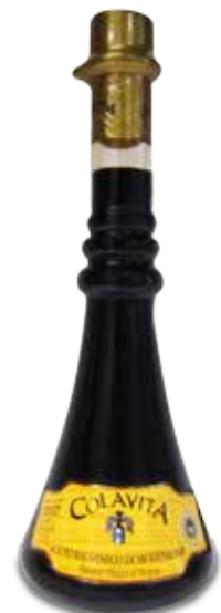
Sweet Balsamic Vinegar Tusca 250ml x 12 - COLV9E