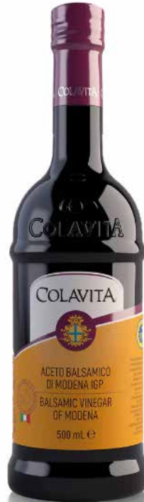
Sweet Balsamic Vinegar I.G.P 500ml x 6 - COLV7X6