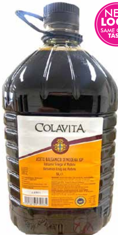
Balsamic Vinegar 5Lt x 2 - COLV9