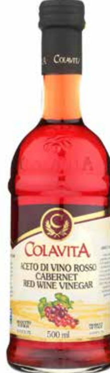
Cabernet Wine Vinegar 500ml x 6 - COLV3A