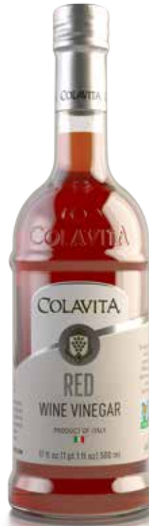
Red Wine Vinegar 500ml x 6 - COLV1X6