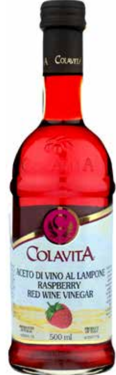
Raspberry Wine Vinegar 500ml x 6 - COLV4A