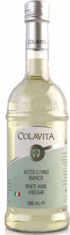
White Wine Vinegar 500ml x 6 - COLV2X6