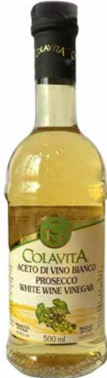
Prosecco White Wine Vinegar 500ml x 6 - COLV5