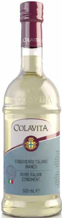
White Italian Condiment 500ml x 6 - COLV6B