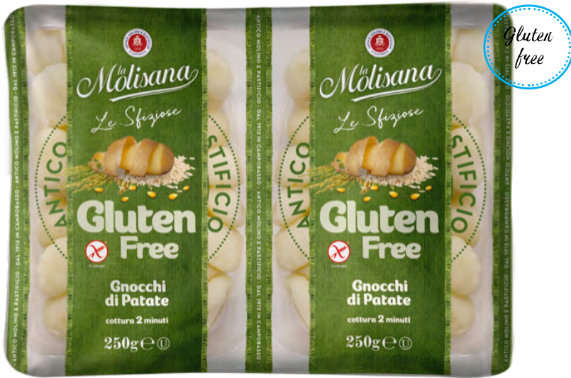
Gnocchi Gluten Free 500g x 11 - PGFGW