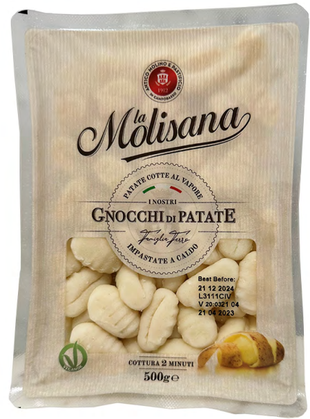
Gnocchi Di Patate 500g x 12 - PGPWX12