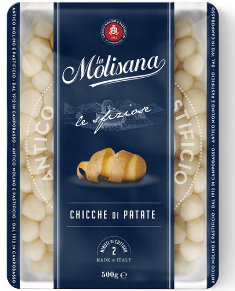
Chicche Di Patate 500g x 12 - PCPWX12