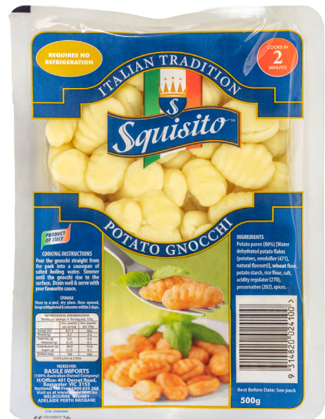
Gnocchi 500g x 12 - SQU20