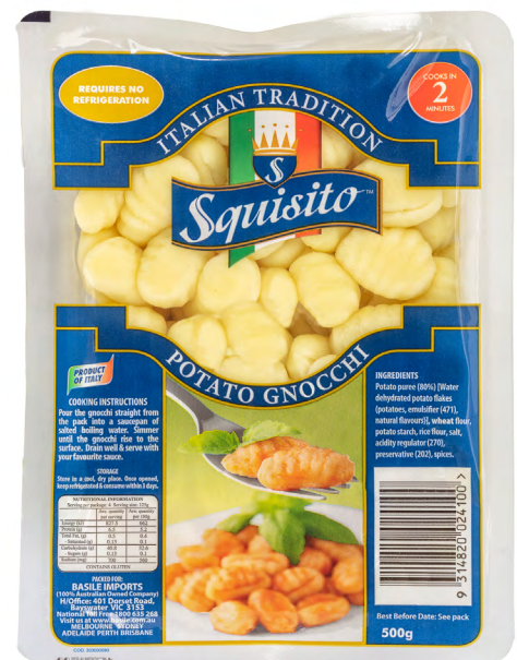
Gnocchi 500g x 12 - SQU20