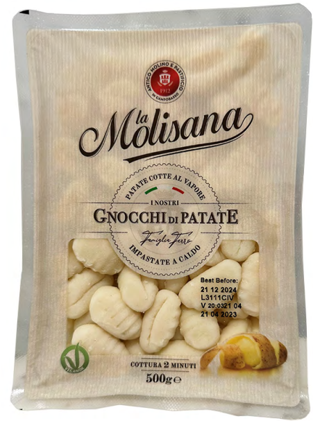
Gnocchi Di Patate 500g x 12 - PGPWX12