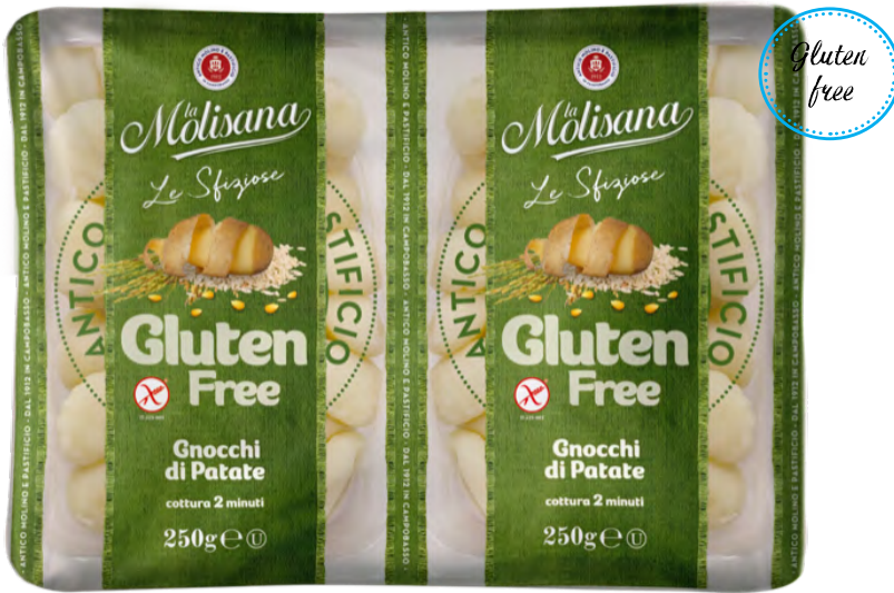
Gnocchi Gluten Free 500g x 11 - PGFGW