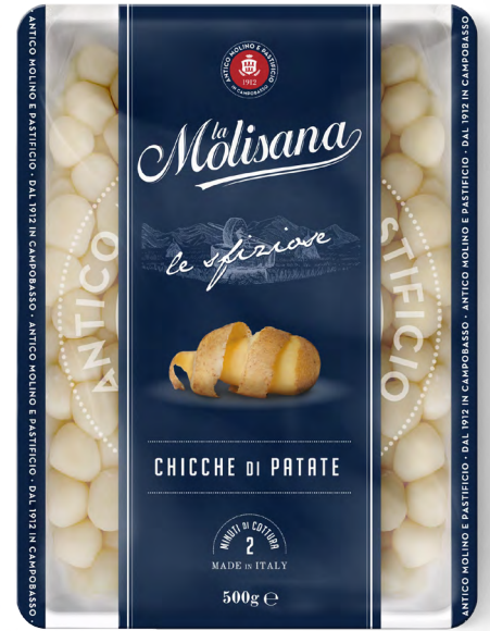
Chicche Di Patate 500g x 12 - PCPWX12