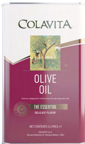
100% Italian Pure Olive Oil 3lt x 4 - COL3T