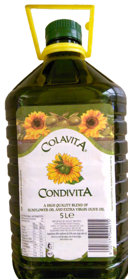
Condivita Sunflower & Extra Virgin 5lt x 2 - CE/SAN3