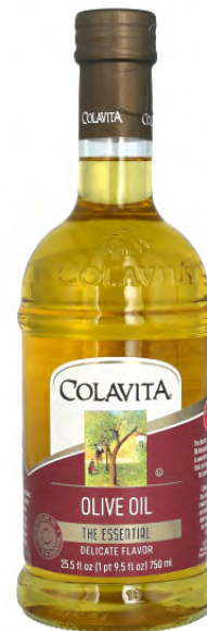
100% Italian Pure Olive Oil 750ml x 6 - CO750