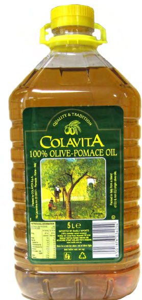
Pomace Oil 5lt Dame x2 5lt x 2 - COL5TPOMX2