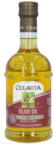
100% Italian Pure Olive Oil 500ml x 6 - CO500X6