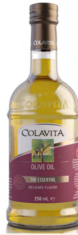
100% Italian Pure Olive Oil 250ml x 12 - CO250