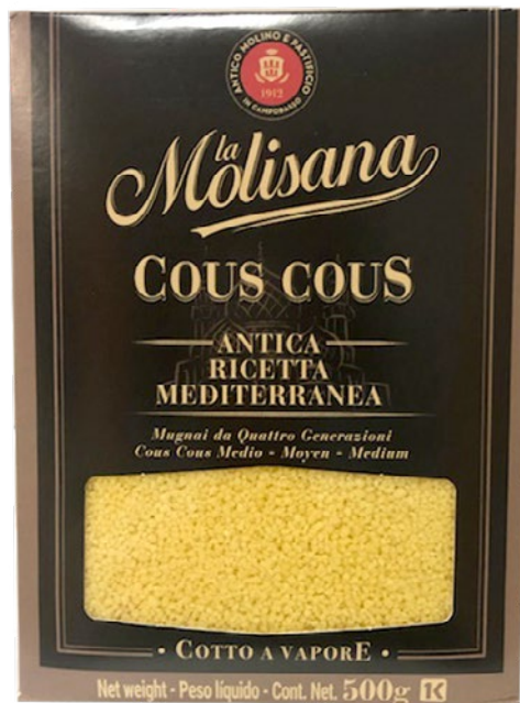
Couscous 500g x 12 - PCOUS12